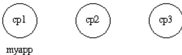
Figure 9.1: Application myapp - Situation 1

When all nodes are up and running, myapp can be started. This is achieved by calling application:start(myapp) at all three nodes. It is then started at cp1 , as shown in the figure below.