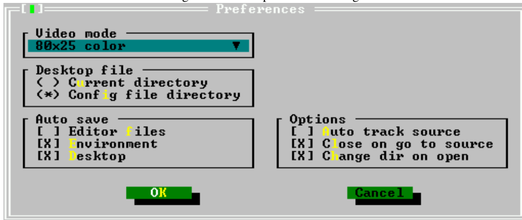
Figure 6.33: The preferences dialog

Video mode The drop down list at the top of the dialog allows selecting a video mode. The available video modes depend on the system on which the IDE is running.