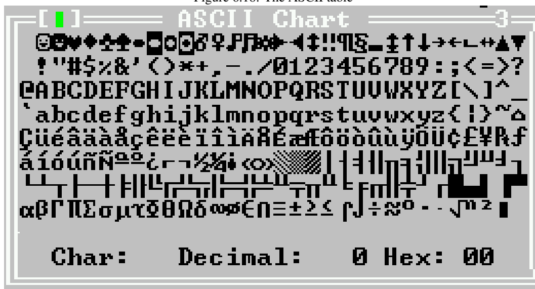
Figure 6.18: The ASCII table

The ASCII table remains active till another window is explicitly activated; thus multiple characters can be inserted at once. The ASCII table is shown in figure (6.18).