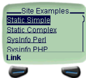
Figure 12.2: Site Examples index

6. The card in Figure 12.2 is displayed.