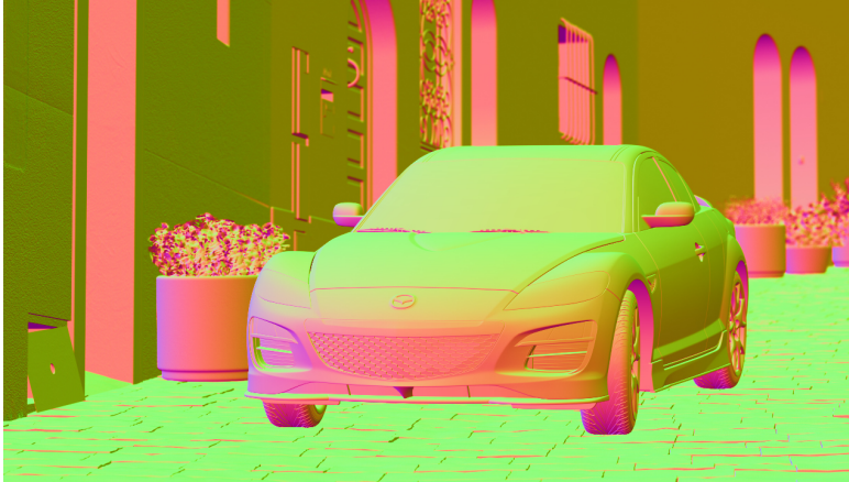
Figure 3.5 – Example normal image obtained using the first hit (the values are actually in [-1, 1] but were mapped to [0, 1] for illustration purposes).

Similar to the albedo, the normal can be stored for either the first or a subsequent hit (if the first hit has a perfect specular/delta BSDF).