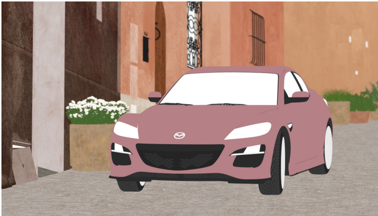
Figure 3.3 – Example albedo image obtained using the first hit. Note that the albedos of all transparent surfaces are 1.

The albedo for layered surfaces can be computed as the weighted sum of the albedos of the individual layers. Non-absorbing clear coat layers can be simply ignored (or the albedo of the perfect specular reflection can be used as well) but absorption should be taken into account.