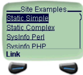
Figure 12.2: Site Examples index

6. The card in Figure 12.2 is displayed.