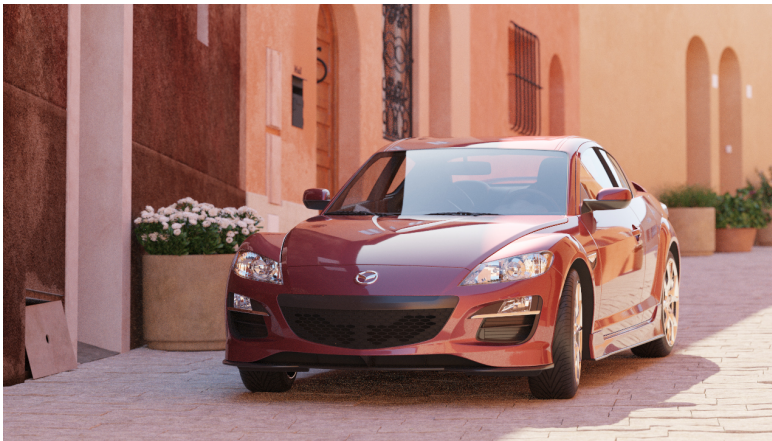
Figure 3.1 – Example noisy color image rendered using unidirectional path tracing (512 spp). Scene by Evermotion.

All specified images must have the same dimensions.