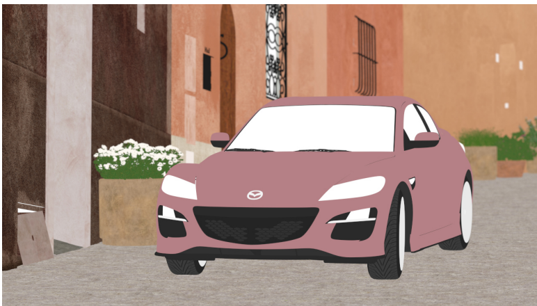
Figure 3.3 – Example albedo image obtained using the first hit. Note that the albedos of all transparent surfaces are 1.

The albedo for layered surfaces can be computed as the weighted sum of the albedos of the individual layers. Non-absorbing clear coat layers can be simply ignored (or the albedo of the perfect specular reflection can be used as well) but absorption should be taken into account.