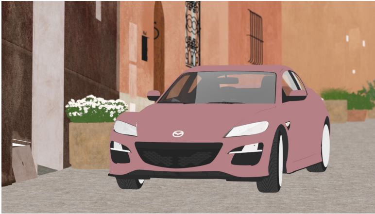
Figure 3.4 – Example albedo image obtained using the first diffuse or glossy (non-delta) hit. Note that the albedos of perfect specular (delta) transparent surfaces are computed as the Fresnel blend of the reflected and transmitted albedos.